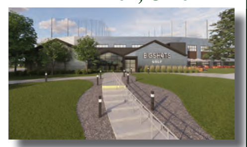
Rendering above is courtesy of BigShots Golf

Hammontree was hired by BigShots Golf for base mapping and construction staking of the new BigShots Golf Facility located at 600 Swartz Road in Akron, Ohio.