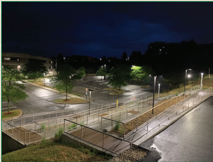
Photo shown above: ADA ramp project for NEXT Architecture and Comcast in Pennsylvania by Morris Knowles & Associates, A Hammontree Company.

Landscape Architecture is offered at each of our offices. Our registered professional landscape architect is registered in Ohio, Pennsylvania and West Virginia.