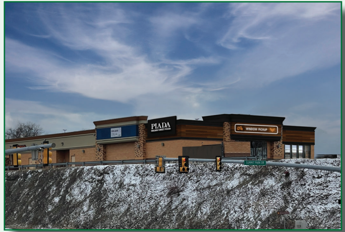
Above rendering of the future Piada Restaurant in North Fayette, PA