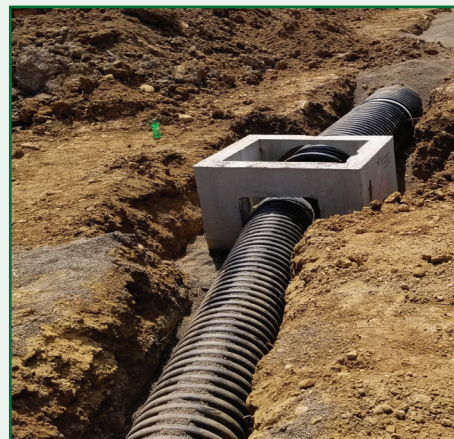
Photo shown above: Construction observation of a storm sewer installation at Hidden Lakes Subdivision in the Village of Lakemore