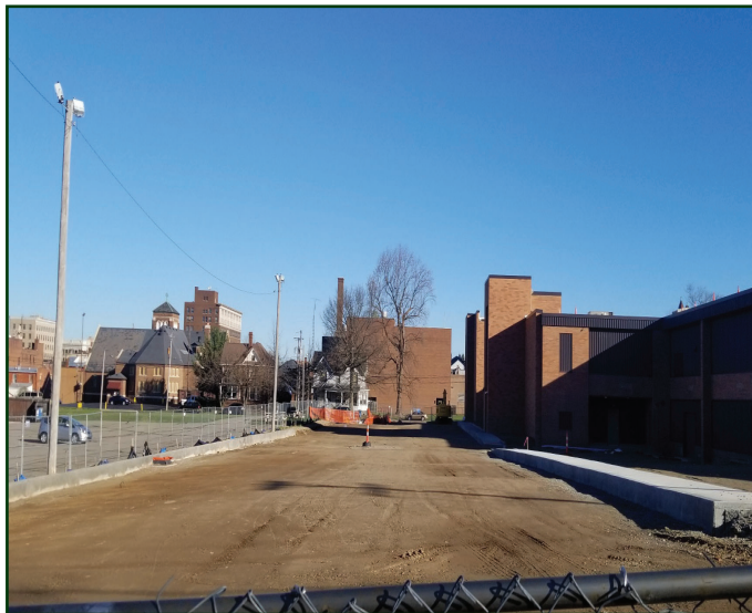
Photo shown above: Massillon City Schools Operations Center under construction