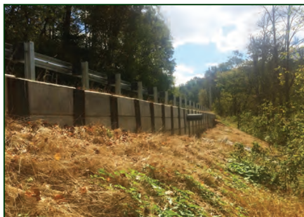
Photo shown above: Hammontree has designed multiple soldier pile and lagging walls to remediate slips along public and private roadways. We have completed both publicly funded projects in coordination with county engineers as well as privately funded projects.