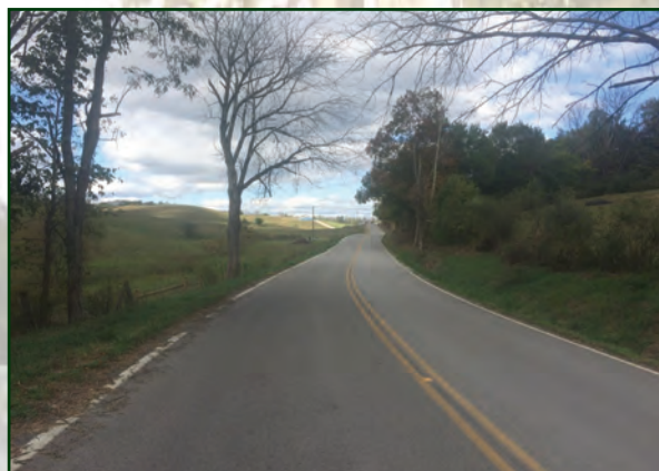
Photo shown above: Hammontree has completed road assessments and condition reports for multiple roads in the Ohio Valley Region. Road upgrade plans have been created when road analysis shows the road is not in a condition of handling the proposed traffic load. Road upgrades can include subgrade and pavement design, road widening, road realignment and vertical curve realignments.

Photo shown above: Hammontree has designed multiple soldier pile and lagging walls to remediate slips along public and private roadways. We have completed both publicly funded projects in coordination with county engineers as well as privately funded projects.