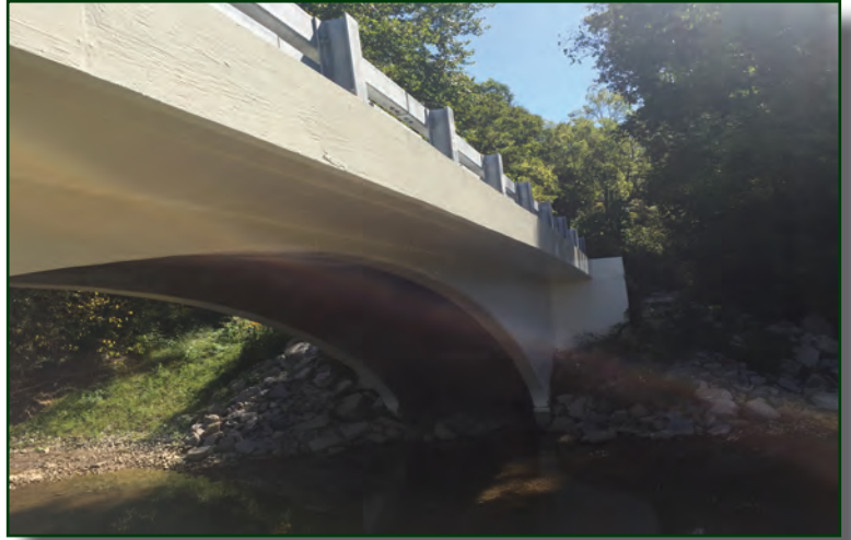
Photo above: Monroe County Bridge MOE-TR313-00.04

Hammontree designed a new concrete deck overlay to preserve as much of the original structure as possible. The edges of the deck were removed and replaced. Hammontree retained the historic bridge elements while upgrading the overall condition of this historic structure.