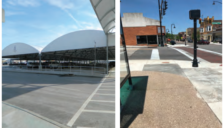
Photos shown left to right: Akron Canton Airport new parking and new entrance/exit road and the City of Cuyahoga Falls Front Street Downtown Transformation Design-Build Project.

Each office is staffed with registered engineers and surveyors who ensure projects are managed with prompt professional service.