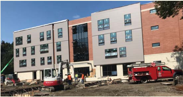
Photo above: Action Housing - Forest Hills Veteran Housing located on Ardmore Boulevard in the Borough of Forest Hills, PA.

The facility will have 21 units with a preference for veterans, and 20 units will have a preference for seniors. Six units will be fully accessible, including two units for hearing and vision impaired individuals.