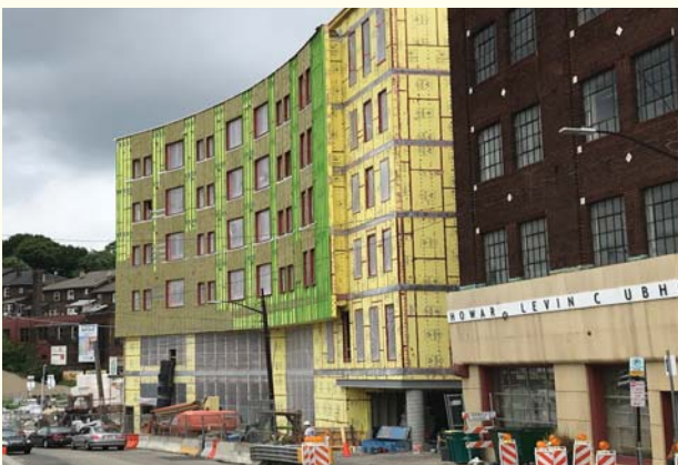
Photo above: Action Housing - Squirrel Hill Gateway Lofts in the Squirrel Hill Neighborhood of the City of Pittsburgh, PA.

In addition to the residential component of the building, a small commercial space will be located at street level along Penn Avenue, with direct access to an outdoor patio. MKA was hired to complete the civil site plans, various permitting through City agencies, and construction services. This project is currently under the design phase and will go to construction in early 2019.