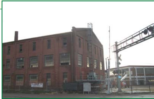
Photos shown: New Hercules Apartments in Canton, Ohio; Photo shown lower right: Historic Hercules Engine Plant before renovations.