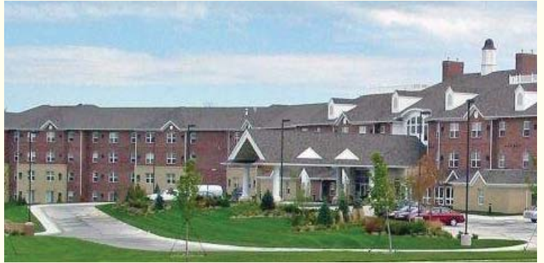
Photo above: A Resort Lifestyle Community in the western United States

Resort Lifestyle Communities and Cameron General Contractors hired H&A to provide civil engineering, surveying and permitting for a new $15 million Resort Lifestyle Community. This 133 apartment, independent living facility will be located on 11 acres off Barlow Road in Hudson, Ohio. The project is currently in the permitting and review phase with construction to begin in late fall 2018.