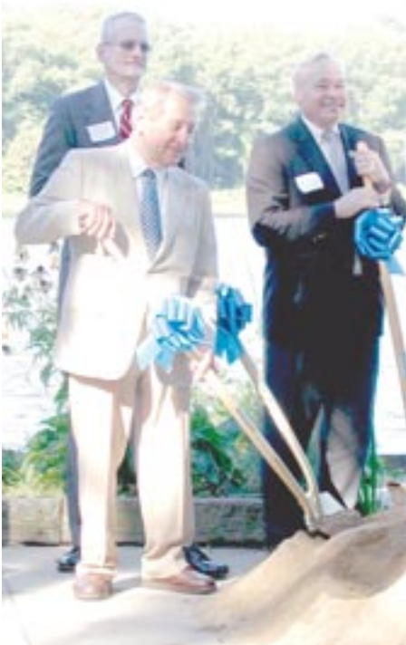
Congressman Ralph Regula

Recent groundbreakings signaled the start of two highly anticipated buildings. The Stark County Park District and the Stark County District Library have teamed up to construct a new building that will house the SCDL Perry Branch