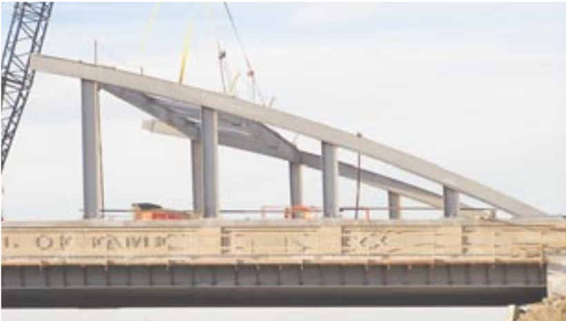
Installation of arches