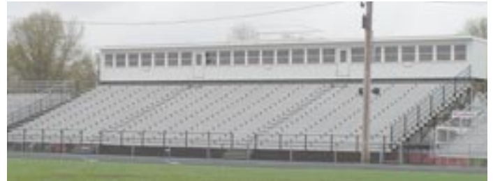
Visitors side of North Canton Memorial Stadium

high school districts. Inspection of the bleachers included a visual "hands-on" evaluation of the foundations, support structures, and seating areas to identify physical damage due to deterioration or other causes. Additionally, the inspections attempt to identify safety issues based on guidelines established by the U.S. Consumer Product Safety Commission. Our reports and opinions help administrators set schedules, budgets and priorities of repairs. This professional service assists school districts in keeping their facilities safe for their patrons and the general public. ■