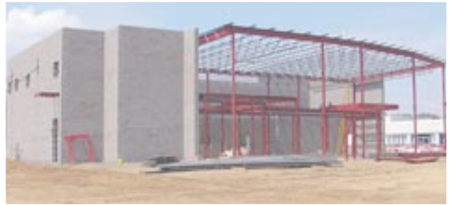
Cain BMW under construction

The growth in North Canton and Jackson Township in Northern Stark County continues. With growth comes a plethora of transportation problems and solutions as well as the expansion of retail stores.