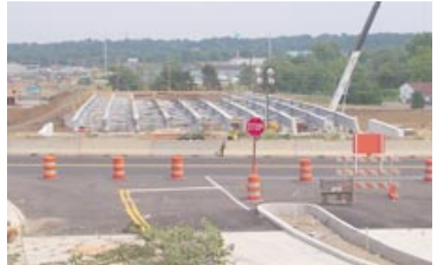
Looking east from The Strip