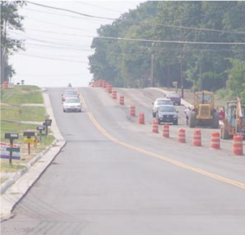
Jackson Township's Portage Street widening ready for traffic.